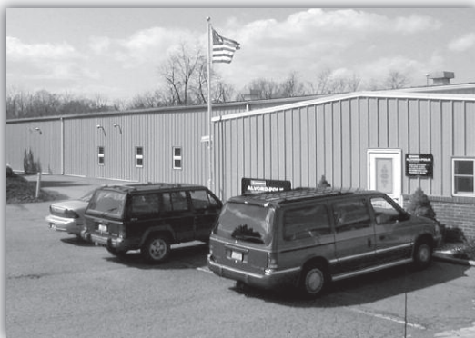
▲ 30,000 sq. ft. production facility in Elizabethville, Pa.

ORDER ONLINE ► Orders may be placed at www.mortonmachine.com