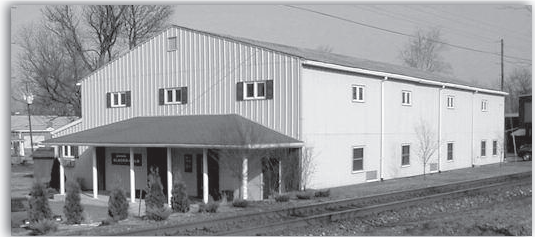
▲ Sales offices located in Millersburg, Pa.

BUSINESS HOURS ► Office hours are Monday through Friday 8:00 am - 5:00 pm EST