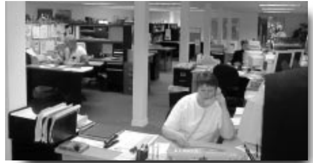
▲ Sales offices for Morton Machine Works.

CATALOGS ► Contact Morton or your local distributor to receive additional catalogs or price lists.